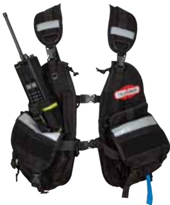
AERO VEST WILDLAND Modular vest design with Velcro closure pockets. SIZE: 975cu | ■ HiViz Orange ■ Black