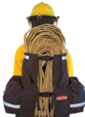
PROGRESSIVE HOSE PACK For carrying hose in a U-shape with color coded webbing. SIZE: 200'–300' hose | ■ Black