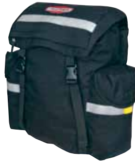
GO! PACK Stand alone pack that attaches to Spyder Gear and Aero Vest. SIZE: 1500cu | ■ Black NFPA 1977