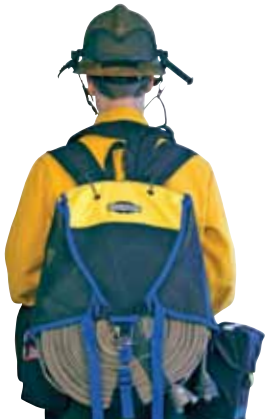
DONUT HOSE PACK Hose carrying pack with colored rip-cords. SIZE: 200' hose | ■ Blue/Yellow