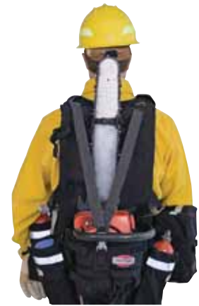
CHAINSAW PACK Low profile wildland chainsaw pack. SIZE: Small/Standard | ■ Black