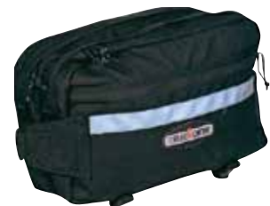
AERO PACK Modular attachment pack for the Aero Vests. SIZE: 750cu | ■ HiViz Orange ■ Black