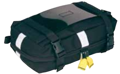
SAR CASE Bottom zip, extra storage pack instead of the fire shelter case. SIZE: 375cu | ■ Black