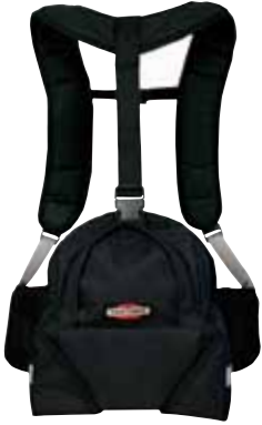
TITAN Smallest wildland pack with interchangeable accessories. SIZE: 180cu | ■ Black