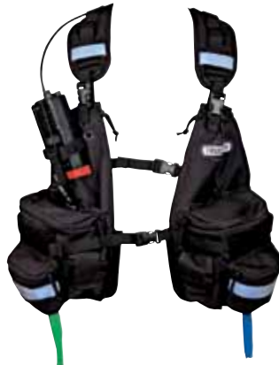
AERO VEST URBAN Modular vest design with Zip closure pockets. SIZE: 975cu | ■ HiViz Orange ■ Black