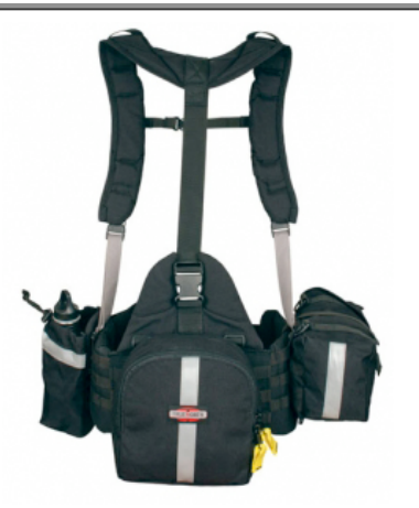
Spyder Gear Essential for the Wildland FF. Now with MOLLE attchement.