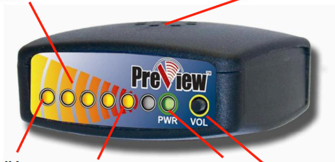
Figure 1. PreView® Operator Display