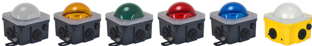
LSGM40180F LSGM40180A LSGM40180G LSGM40180R LSGM40180B LSYSM40180F*