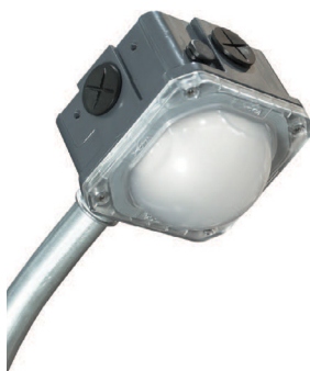
Pole Slip Fitting (PSF)