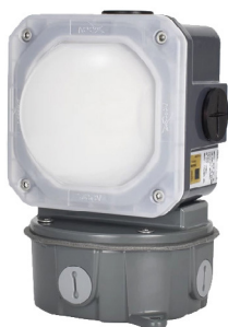
LAGJ1PM (Pendant Mount)