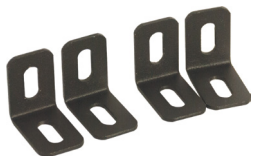
Standard Mount Feet