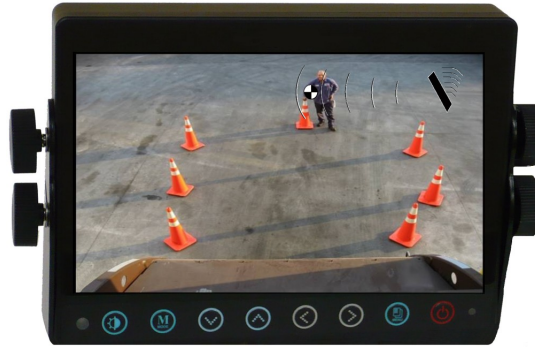
Overlay—First Detection + audible tone, Maximum Distance in Zone

Once the system has been installed, the detection zone should be tested. The test should be performed with two people, one who remains in the cab (the operator), and one who walks through the sensor field to the rear of the vehicle (the assistant). The operator engages the parking brake, presses the vehicle brake, and places the vehicle in reverse. The assistant then walks through the detection zone while the operator notes the indicators on the overlay and hears an audible tone (buzzer). As the assistant moves closer to the vehicle, more indicators appear and the audible tone rate has increased. An accurate detection zone can be mapped by moving about the rear of the vehicle and noting changes to the image as well as the audible tone. Audible tone source is from the VideoLink and / or optional buzzer kit.