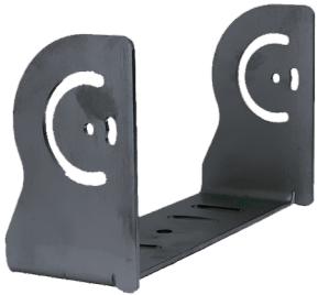
Heavy Duty Trunnion Bracket LUC30-TRHD