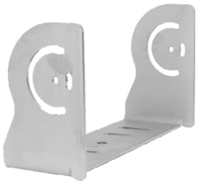
Stainless Steel Trunnion Bracket LUC30-TRHD