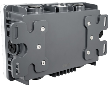
Standard Mount Feet