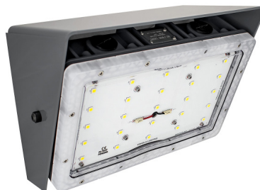
LAGJ5WM (Wall Mount)