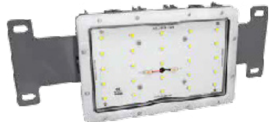
LAGJ5PH1 (Dual Bracket)