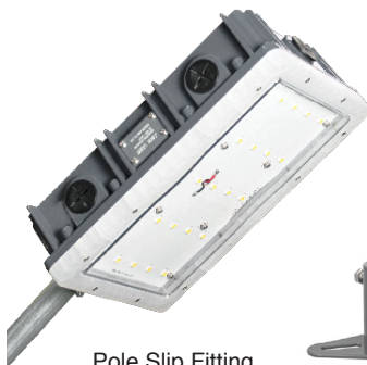
Pole Slip Fitting