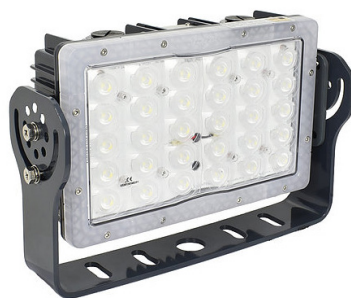
LSG033090TR or LSG02251180TR (Trunnion Bracket)