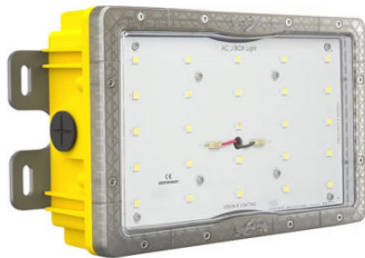
Corrosion Resistant Plastic Dip