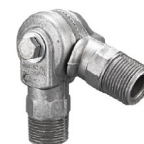
LAGSW34 (3/4" Adjustable Swivel)