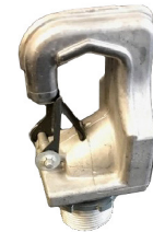
Pendent Mount Hook