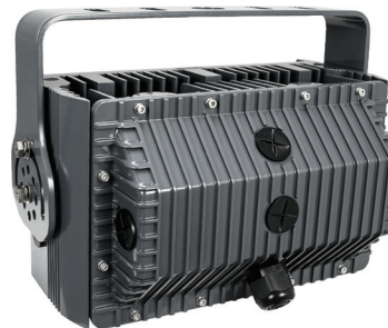
LUC30 Rear View