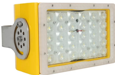
Corrosion Resistant Plastic Dip