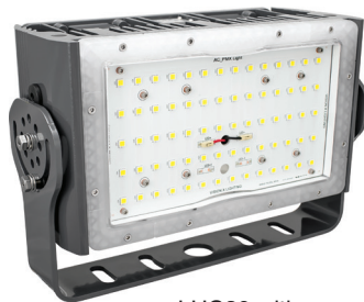
LUC30 with Pole-mount Bracket