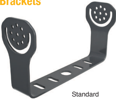
Standard Trunnion Bracket