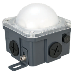
Vision X 10W Junction Box Light

The 10W Junction Box Light fixture by Vision X is ideal for a range of applications on site and features a 180 degree ultra flood beam pattern. Fitted with advanced electronic technology like Pulse Width Modulation, Electronic Thermal Management, and a Redundant Circuit Design for added workplace safety, this junction box light is a dependable and effective LED solution.