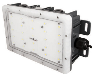
Vision X 50W Junction Box Light

The 50W Junction Box Light fixture by Vision X is ideal for a range of applications on site and comes in a 90 degree wide flood or 180 degree ultra-wide flood beam pattern. Fitted with advanced electronic technology like Pulse Width Modulation, Electronic Thermal Management, and a Redundant Circuit Design for added workplace safety, this general area lighting fixture is a dependable and effective LED solution.