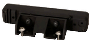
Tilt Bracket / Self-Adhesive