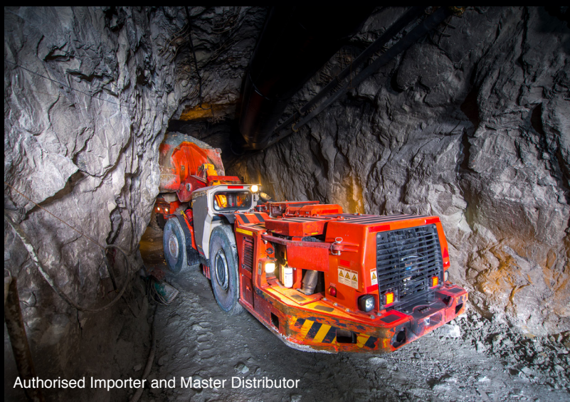
Authorised Importer and Master Distributor