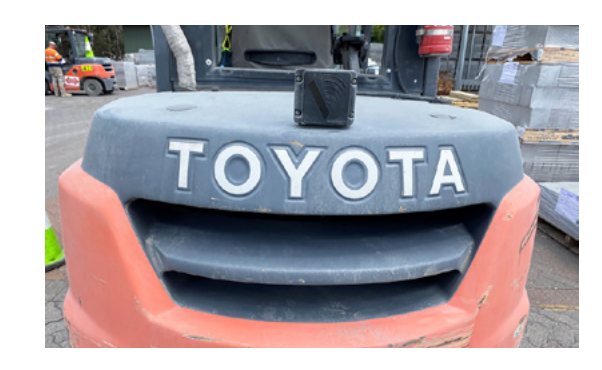
Authorised Importer and Master Distributor