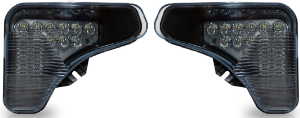
BOBCAT RIGHT HAND FLOOD HEADLIGHT