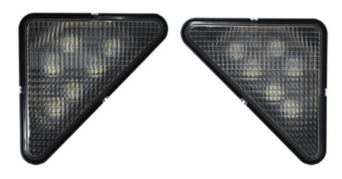
BOBCAT RIGHT HAND HEADLIGHT