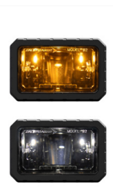
Turn Signals & Daytime Running Lights (DRL)